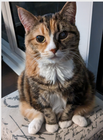
Beanie, age 12 Adopted June 2022

As the average age of our adoptables is 12 years old, it isn’t always easy, but it is so worth it. From cats with diabetes to cats that were 17 years old, our service was able to help animals regardless of the stage they are in life find loving homes.